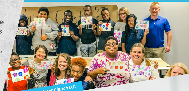
Shine On at Waterfront Church D.C.