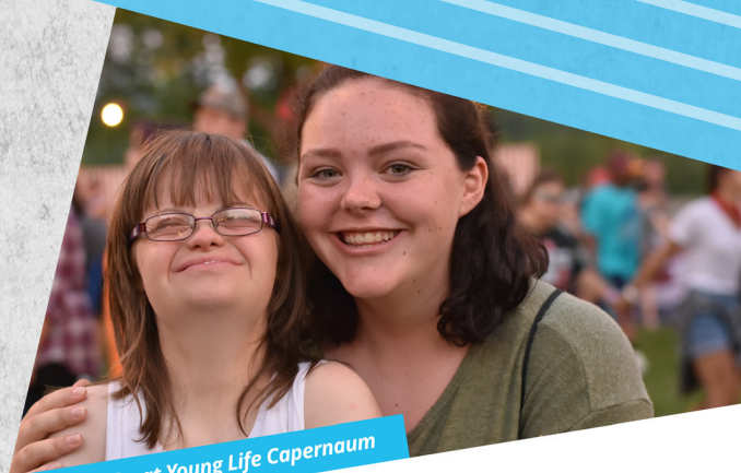
Shine On at Young Life Capernaum

Honored Guests. Volunteers. Host Churches. Vendors. Sponsors. When these groups of people come together every year, something special happens. That something is Night to Shine, now a worldwide movement that has grown exponentially since inception, and is showing no sign of slowing down! The impact has expanded even further through this year's addition of Shine On, a program that connects new and existing special needs ministries with world-class, faith-based resources that train, guide, and support churches as they serve their local community of people with special needs. We are so excited to see how God unites people from all over the world through this new and unique ministry!